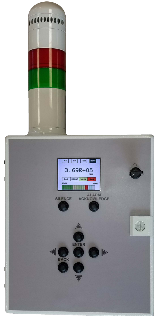
1042WM (Wall Mount Version)

The 10XX UDR can be used with all 943/953 Series Beta and Gamma Scintillation Detectors, all 977 Series Wide Range Ion Chamber Detectors, and all 897A Series GM Detectors. A detector, when connected to the UDR, will comprise a single channel digital process monitoring channel. Simulators are available for all models. The 10XX comes in a rack mountable version and a wall mountable version.